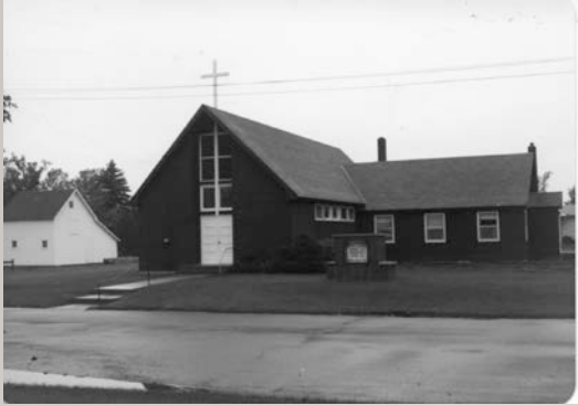
Becker Lutheran Church