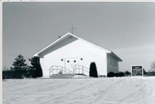
Hope Lutheran Church Orrock