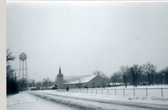
Our Lady of the Lake Catholic Church Big Lake