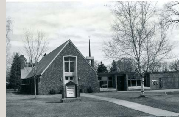
Emmanuel Lutheran Church Elk River