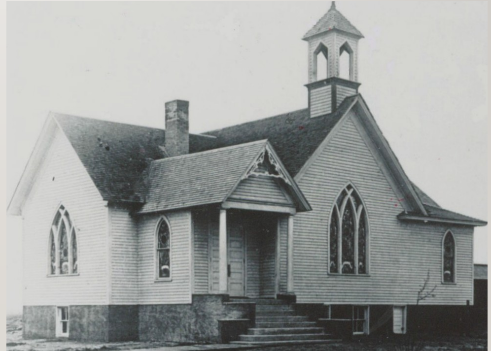
Becker Methodist Episcopal Church—no date

By briefly exploring the development of Churches in Sherburne County we gain greater insight into the process of settlement of the county.