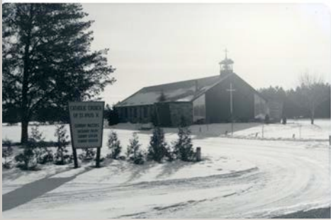
St. Pius X Catholic Church Zimmerman