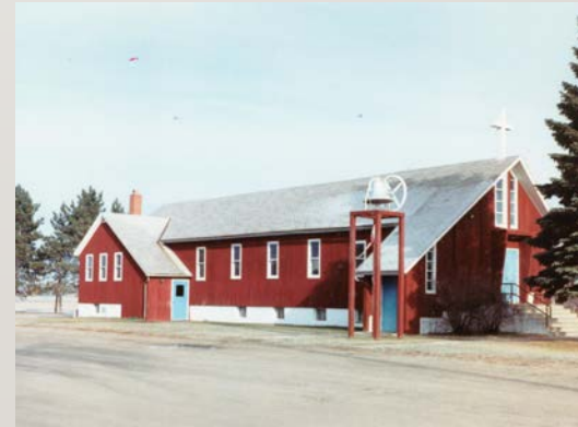
St. Joseph's / Immaculate Conception Catholic Church Becker