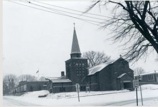
St. Andrew's Catholic Church & School Elk River