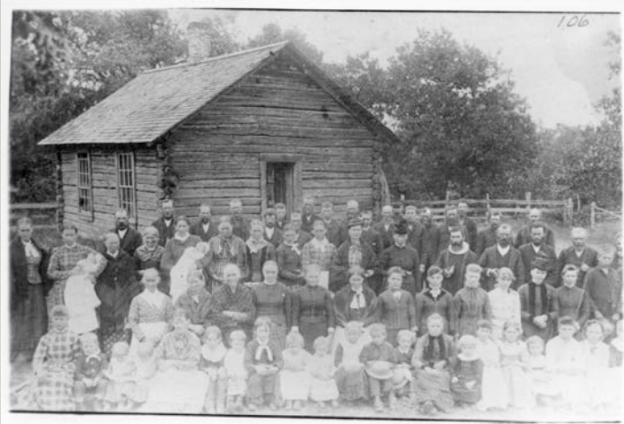
Eids Kigen Kirke congregation log church Orrock - Eidskog ca 1900