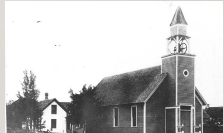
Becker Episcopal Church