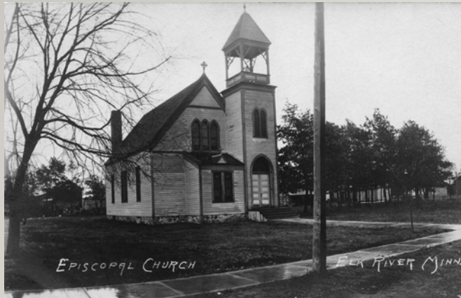
Trinity Episcopal Church Elk River