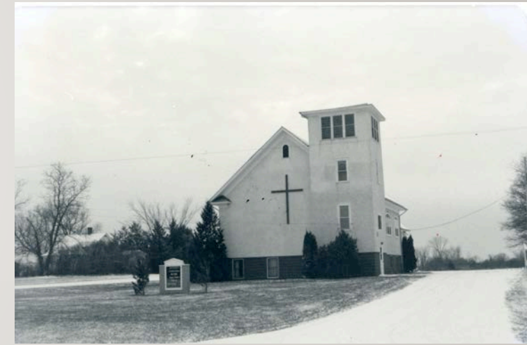
Our Saviors Lutheran Church Santiago