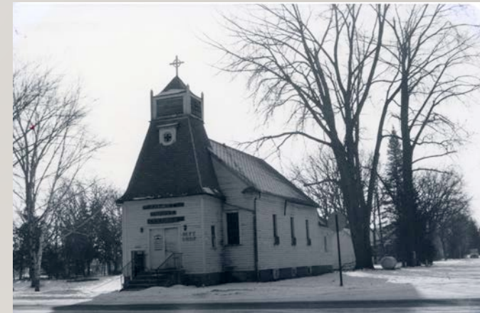
St. John's Lutheran Church Zimmerman