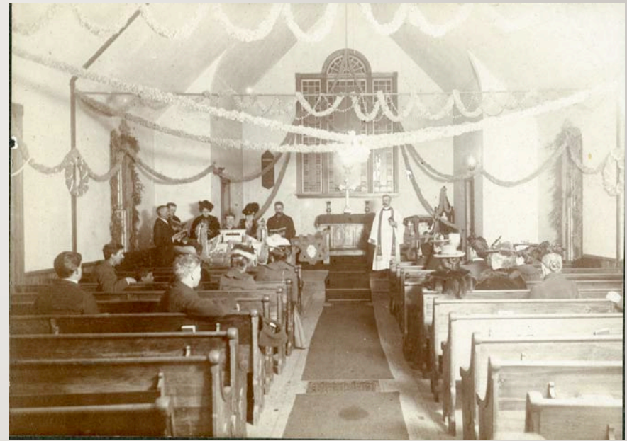
Becker Episcopal Church – interior