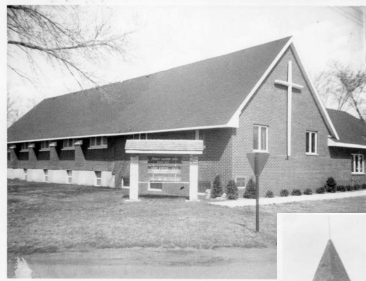
Trinity Lutheran Church Cable