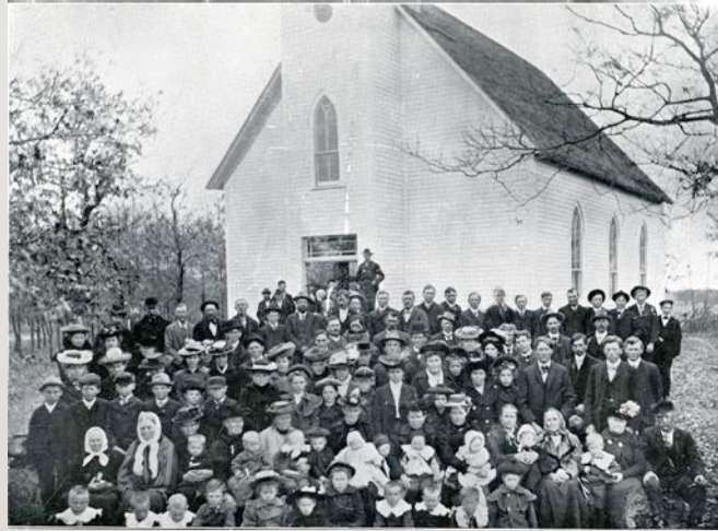
Orrock Evangelical Norwegian Lutheran Church congregation ca. 1898