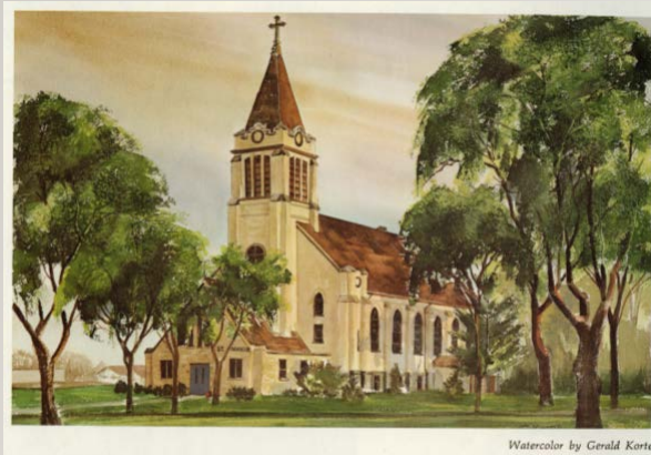
St. Marcus Catholic Church Clear Lake